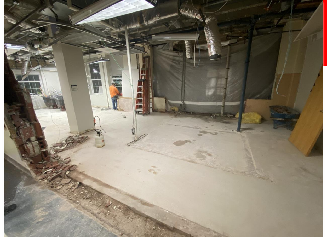
Charles Allen Building Demolition Progress for New Terrazzo Flooring Area